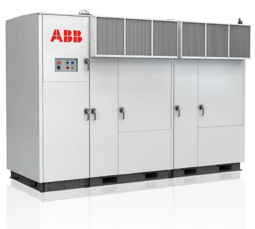
ABB central inverters raise reliability, efficiency and ease of installation to new levels. The inverters are aimed at system integrators and end users who require high-performance solar inverters for large photovoltaic (PV) power plants. PVS980 central inverters are available from 1818 kVA up to 2000 kVA, and are optimized for cost-effective, multi-megawatt power plants.