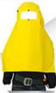
Spray Painting Hood