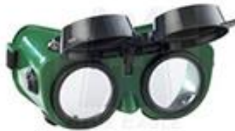
Welding Goggles GW250