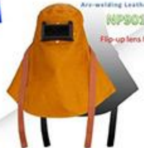
Welding Leather Hood NP901

Air-welding Leather Hood NP901 Flip-up lens holder