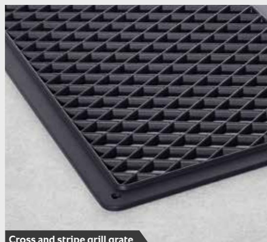
Cross and stripe grill grate