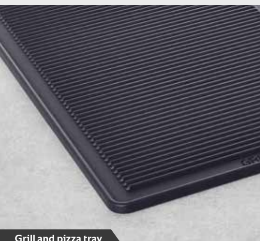
Grill and pizza tray

Our UltraVent condensation technology is also available in an UltraVent Plus model, which is equipped with special filters. to prevent steam as well as bothersome smoke that could otherwise develop when grilling or roasting. RATIONAL units can thus be installed even in critical locations, such as front shop-front areas.