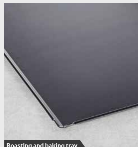
Roasting and baking tray