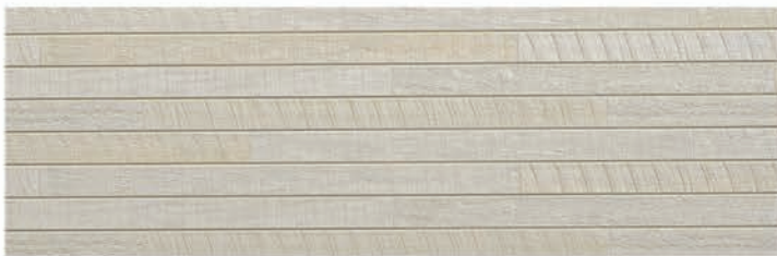
NASHIR Sage Brush ( Pantone 13-1105 TPG )