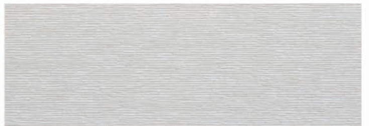
ANTARES Iceberg ( Pantone 7528 CP )