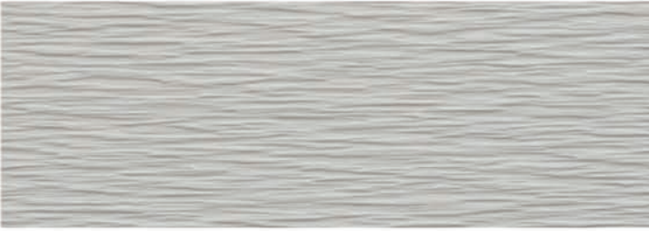
ZETA Cream of Abalone ( Pantone 14-1107 TPG )