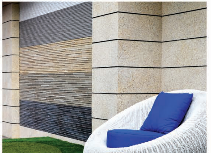
ASTRA / CERES Series