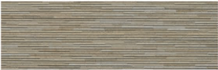
ASTRA Buckwheat ( Pantone 16-1120 TPG )