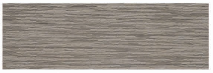
ANTARES Harbor Gray ( Pantone 2325 CP )