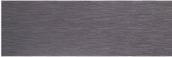
GAMMA Dorian Gray ( Pantone 2336 CP )