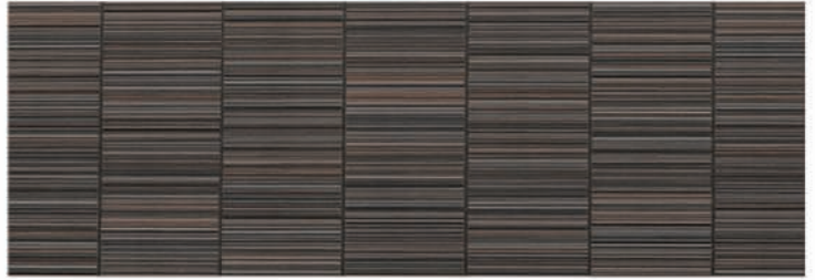
ARTEMIS Butterscotch ( Pantone 405 CP )