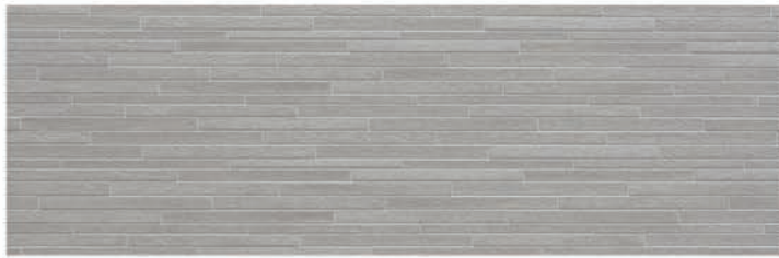
KASTRA Ash Lava ( Pantone 7536 CP )