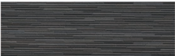
ASTRA Forged Iron ( Pantone 2333 CP )