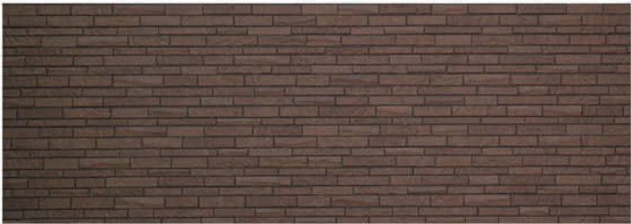
ROHINI Tobacco Smoke ( Pantone 2472 UP )