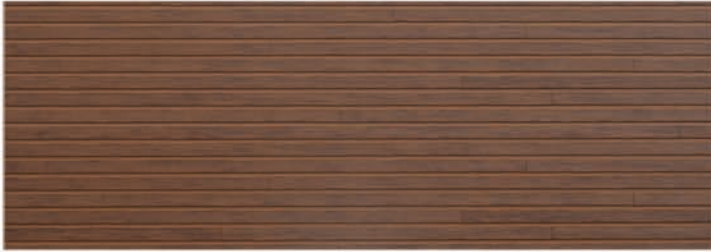
INDUS Carob Bean ( 2320 U )