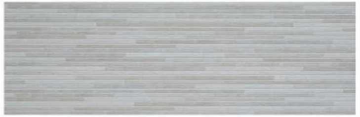
RIGEL Heartstone ( Pantone 14-1106 TPG / 2323 CP / 7535 CP )