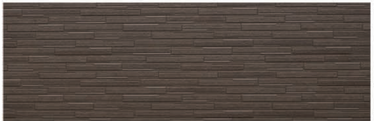
ORION Espresso ( PQ 8405C )