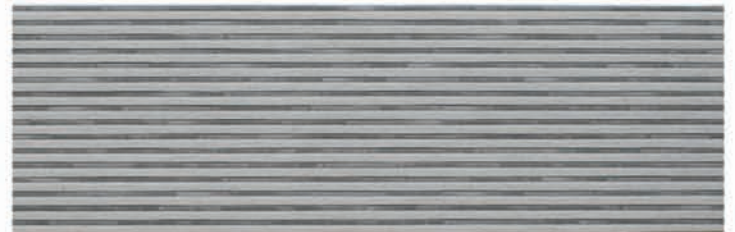
VESTA Ice Mountain ( Pantone 14-0708 TPG / 18-4105 TCX )