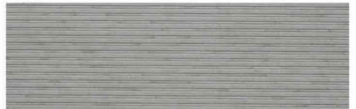
VESTA Platinum ( Pantone 2323 CP )