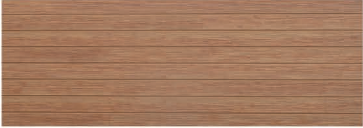
SARIN Classic Pecan ( Pantone 7574 UP )