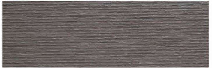
AQUILA Crow's Peak ( PQ-405C )