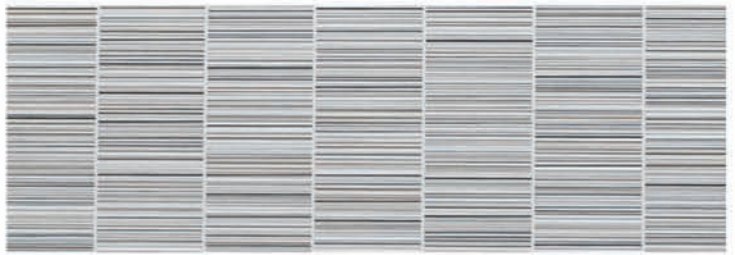
ARTEMIS Fossil ( Pantone 7535 CP )