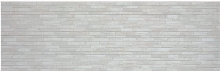
ROHINI Feather Cloud ( Pantone 13-0401 TCK / 14-0708 TPG )