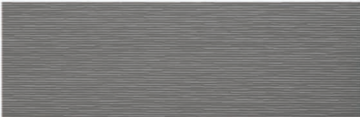
CERES Nimbus Gray ( Pantone 16-0205 TCK )

Leave limitations behind and tap into the power of P O S S I B I L I T I E S . . .