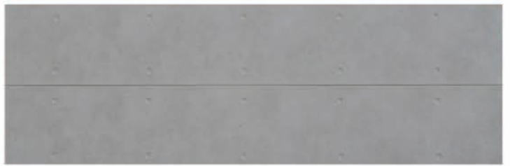
CORVI Chromium ( Pantone 414 CP )