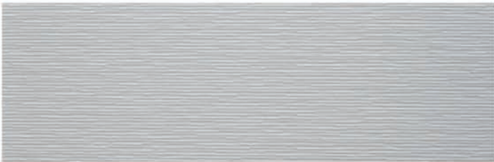
CERES Porcelain White ( Pantone 13-4403 TPG )

Leave limitations behind and tap into the power of P O S S I B I L I T I E S . . .