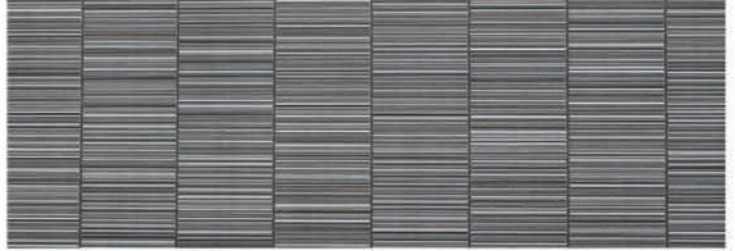
ARTEMIS Graphite ( Pantone 416 CP )