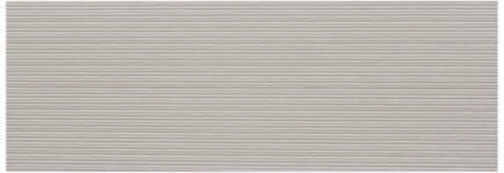
KAPPA Oriental Coast ( Pantone 13-0401 TPG )