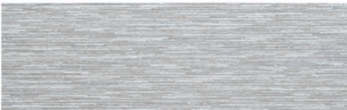
LYNX Street Wool ( Pantone 7535 CP )