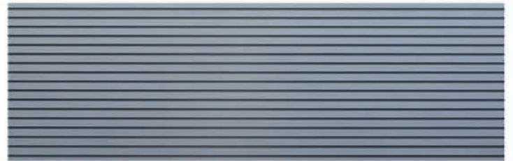
ALPHARD Silver Fox ( Pantone 431 CP )