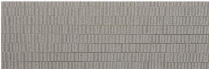
MEROPE River Rhino ( Pantone 15-6410 TPG )