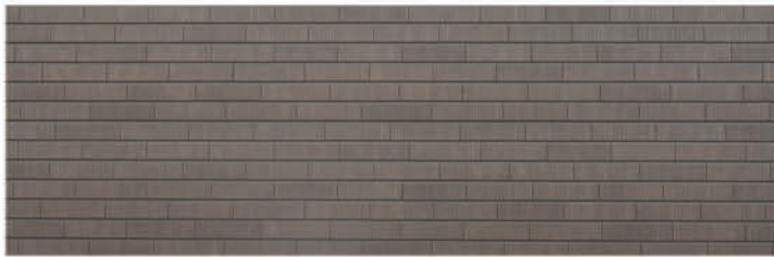
DRACO Dark Hickory ( Pantone 150-2-5 U )