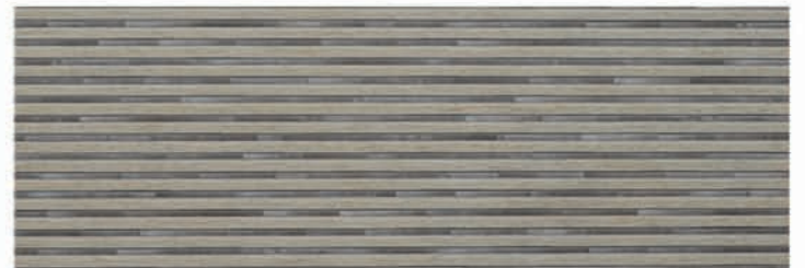
VESTA Oakmont ( Pantone 2324 CP / 403 CP )