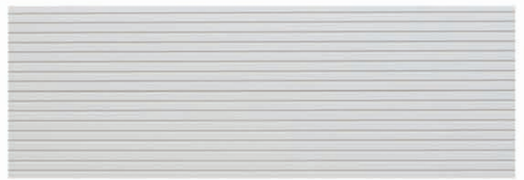
ALPHARD Cocoon White ( Pantone 14-4501 TPG )