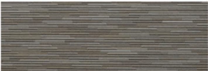
ASTRA Cinder ( Pantone 17-1107 TCK )