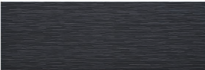
CERES Licorice Black ( Pantone 425 CP )