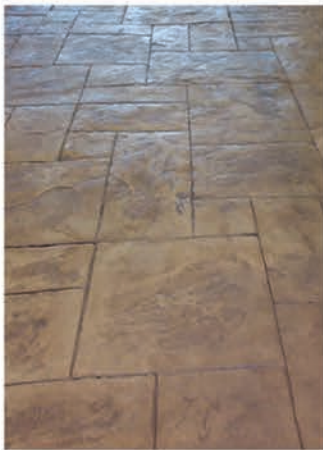
Grand Ashler Slate S-20