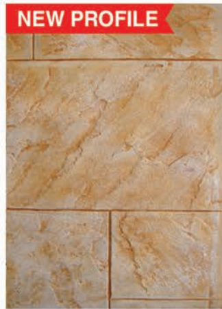
La Habra Ashler Slate S-21