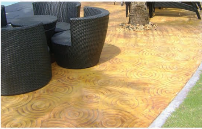
Reflection / S-45