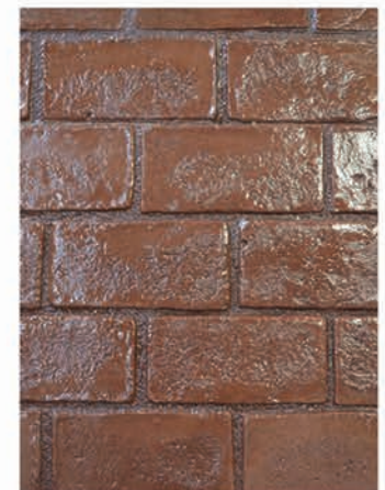
Old Brick Runningbond S-55