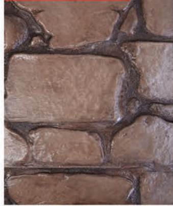
Euro Stone / S-19