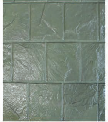
6"x6" Slate Runningbond S-79