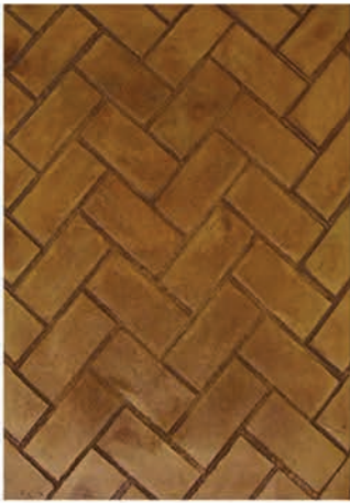
New Brick Herringbone S-52