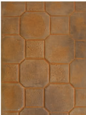
Cobble Paver / S-77