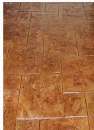
Opa Locka Stone / S-56