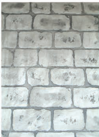
UK Cobblestone / S-30