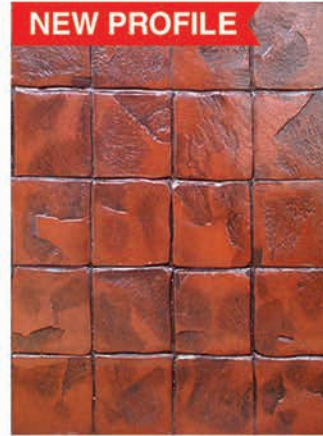
Monte Carlo Slate / S-66