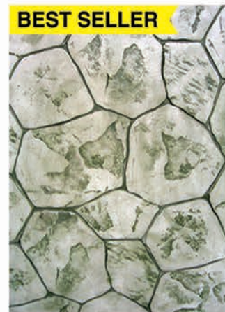
Random Stone / S-29