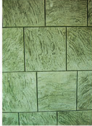
Royal Tile Runningbond S-5