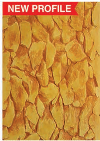
Classic Stone 18"x36" S-74