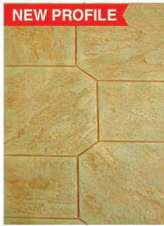
Panama Tile / S-73