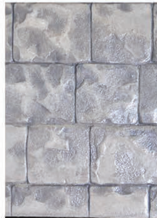
London Cobblestone S-25