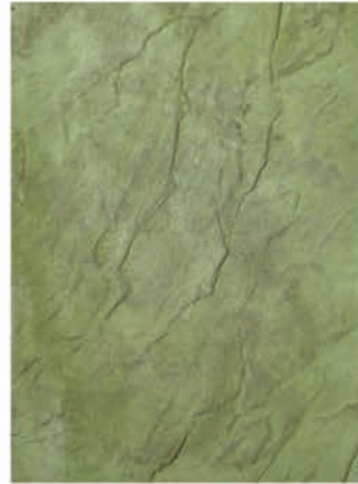
San Diego Slate / S-10