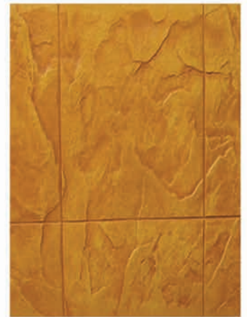
Monster Slate / S-76