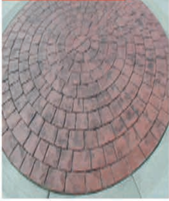
4"X4" Slate Cobblestone Circle / S-66