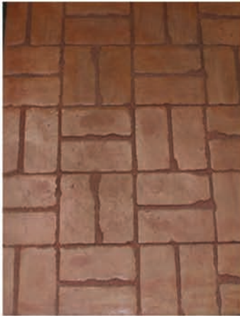
Old Brick Basket Weave S-55