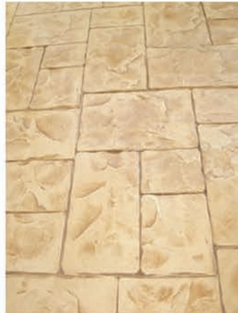
Ashler Slate / S-24