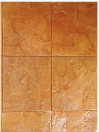
12" Cut Stone / S-57