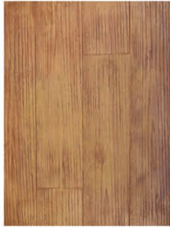
Pacific Boardwalk / S-16