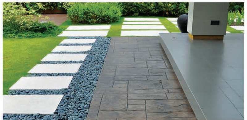
Grand Ashler Slate / S-20