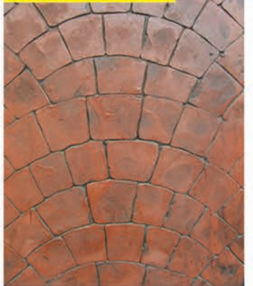
European Fan / S-66