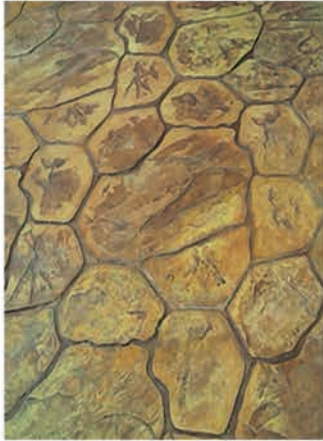
Split Rubblestone / S-44