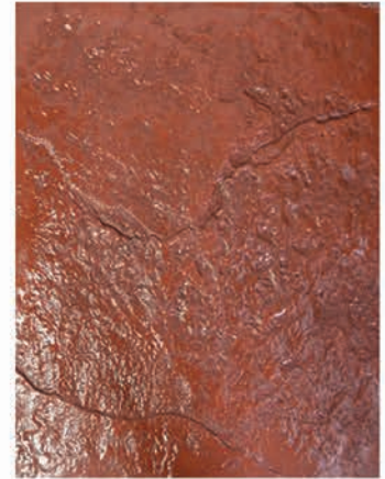
French Granite Medium S-62