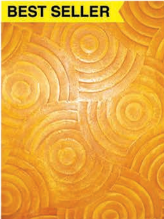
Reflection / S-45