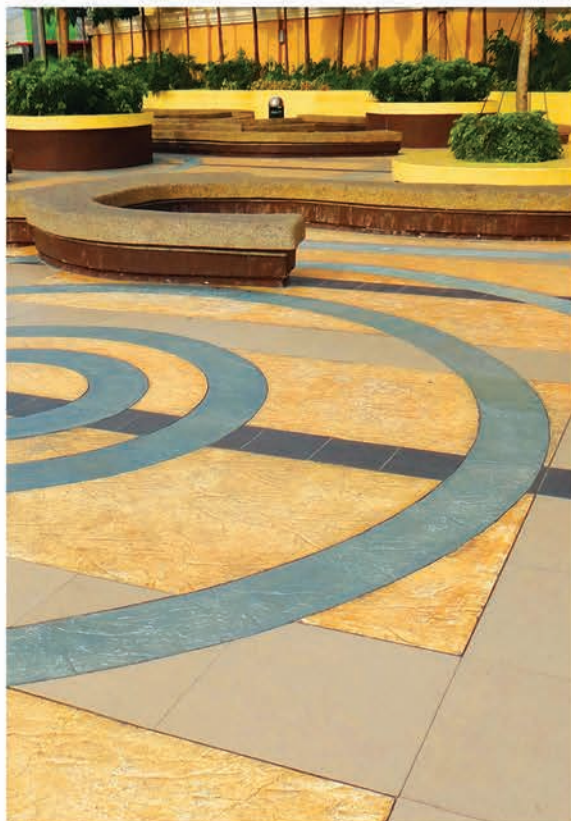
Shawnee Slate Medium / S-34 / S-76