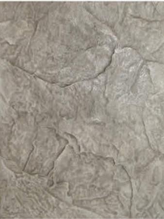
Shawnee Slate Medium S-34