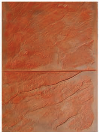
Extra Large Ashler Slate S-26