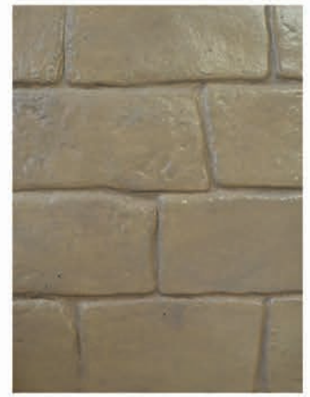
Old English Cobblestone S-82