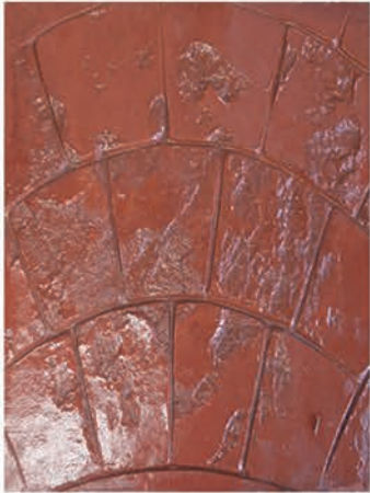
French Fan / S-69